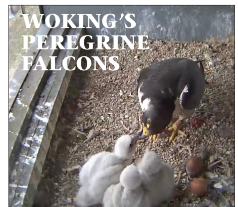
Three chicks have hatched and Mum is being kept very busy feeding them!

Where else can you climb a tree, try archery, meet farm animals, step into a VR experience, make a bird box, ride a pony, discover land-based careers, browse artisan stalls, enjoy street food and live music, all in a single day? From skilled demonstrations to artisan products, every corner of the fair is packed with something special for all ages to enjoy. New for 2026 is the Wellness Village, providing a programme of taster sessions and experiences including activities such as yoga, mindfulness and nature-based wellbeing, reflecting the growing importance of the countryside in supporting both physical and mental health. Contact www.surreyhills.org for more information and to book tickets.