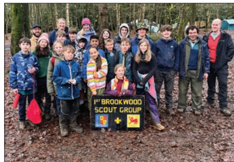
Member of 1st Brookwood Scout group at Frost Camp held at the end of January

It has been an action-packed few months for the Brookwood Scouts! From navigating the dark woods of Surrey to testing their endurance on lightweight hikes and braving the winter chill, our local troop has been incredibly busy. Here is a quick update on what our young people have been achieving lately.