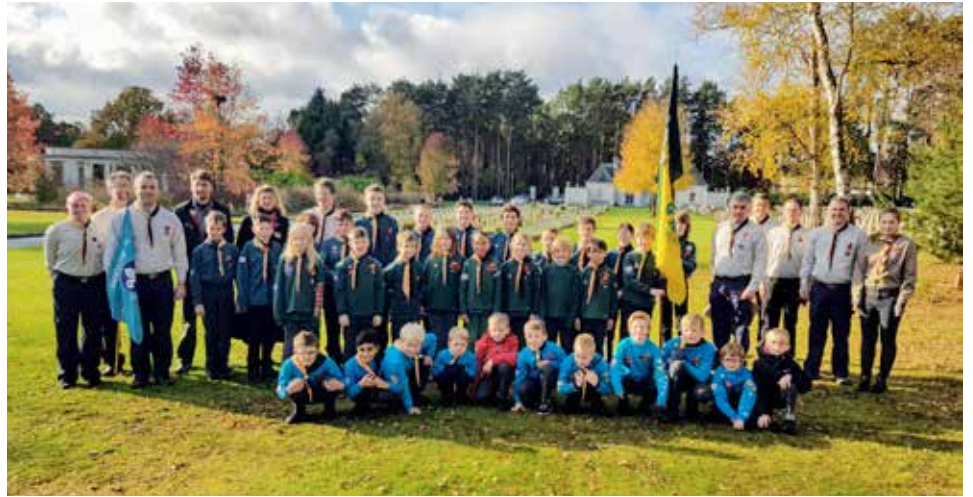
Beavers, Cubs and Scouts preparing to join the Remembrance parade